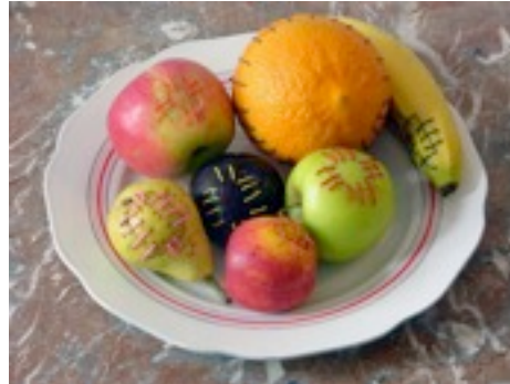
Ádám SZABÓ: Plastic Surgery IV/6, 2008, lambda print, dibond, 45 x 60 cm; 5/2; 1500 $ / for the 2 pieces together