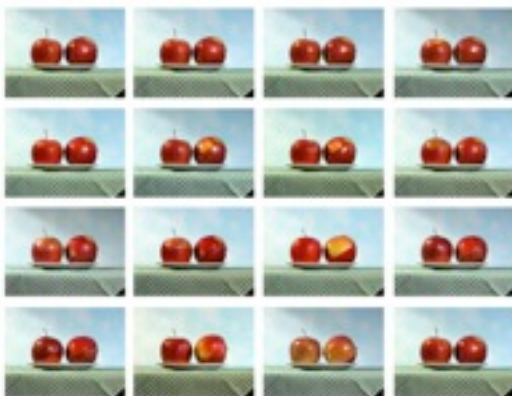
Ádám SZABÓ: Apples - Plastic Surgery, 2007, video, 1'28" loop 1/5 + 1, 1800 $ http://www.szaboadam.hu/eng/portfolio_2007almak01.html