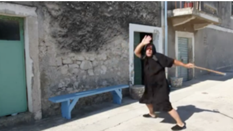
János SZIRTES: Auntie, 2011., Ed. 1 / 5, 2.500 $ http://szirtesjanos.com/index.php/video/2011-aunty-neni/