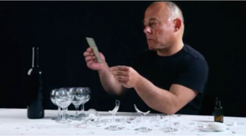
János SZIRTES: Make-up, 2012. Ed. 1/5 2.500 $ http://szirtesjanos.com/index.php/video/2012-make-up-smink/