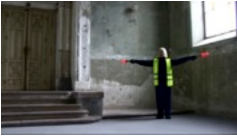
Balázs KICSINY: Home Seeker, 2007, digital film, loop, 2.000 $ http://www.balazskicsiny.com/HOME%20SEEKER.html