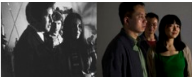
Marianne CSÁKY: Delete, 2010, animated video with sound track, 3:07, Voices: TGNoiz, Ed. 1/5+3 Artist's Edition, 3000 $