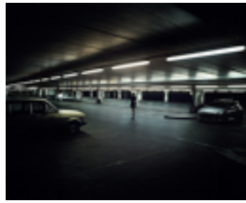
Mátvás MISETICS: Artificial light no.1, 2007, giclée print, tubond, 48x60 cm, (18,72 x 23.4 inch) Edition of 5., 1.600 $